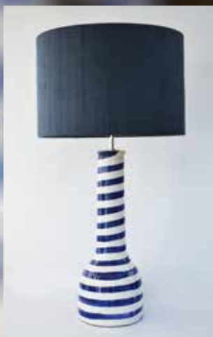
Soho hand glazed ceramic table lamp. Diameter of lamp base 30 cm. Total height of lamp and shade 87cm.