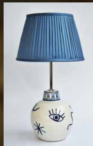
Bomba hand glazed ceramic table lamp. Diameter of lamp 20 cm. Total height of lamp and shade 57cm (Available with a shorter stem).