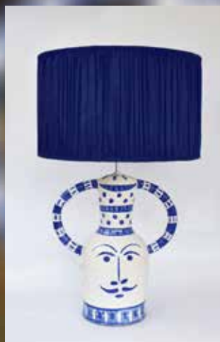
Hilaire hand glazed ceramic table lamp. Diameter of lamp base 20cm. Widest point at arms 36cm Total height of lamp and shade 82cm.