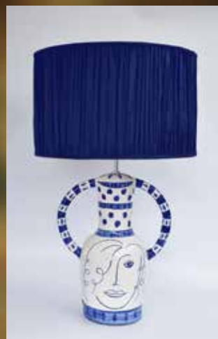
Lady Hilaire hand glazed ceramic table lamp. Diameter of lamp base 20cm. Widest point at arms 36cm Total height of lamp and shade 82cm.